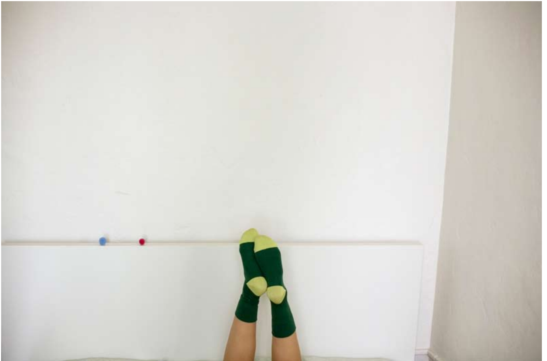
2. merry merry ribbed cuff colorblock. mercerized cotton crew.