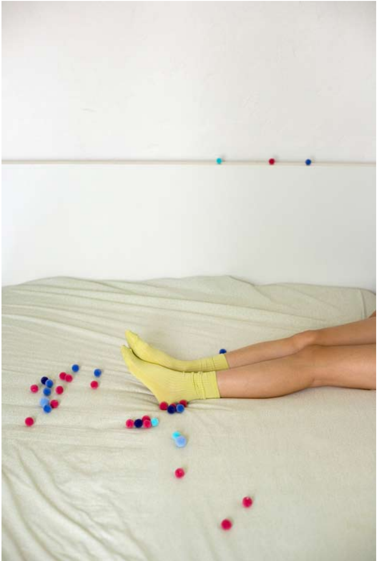
3. giggly silky rib. silk crew.