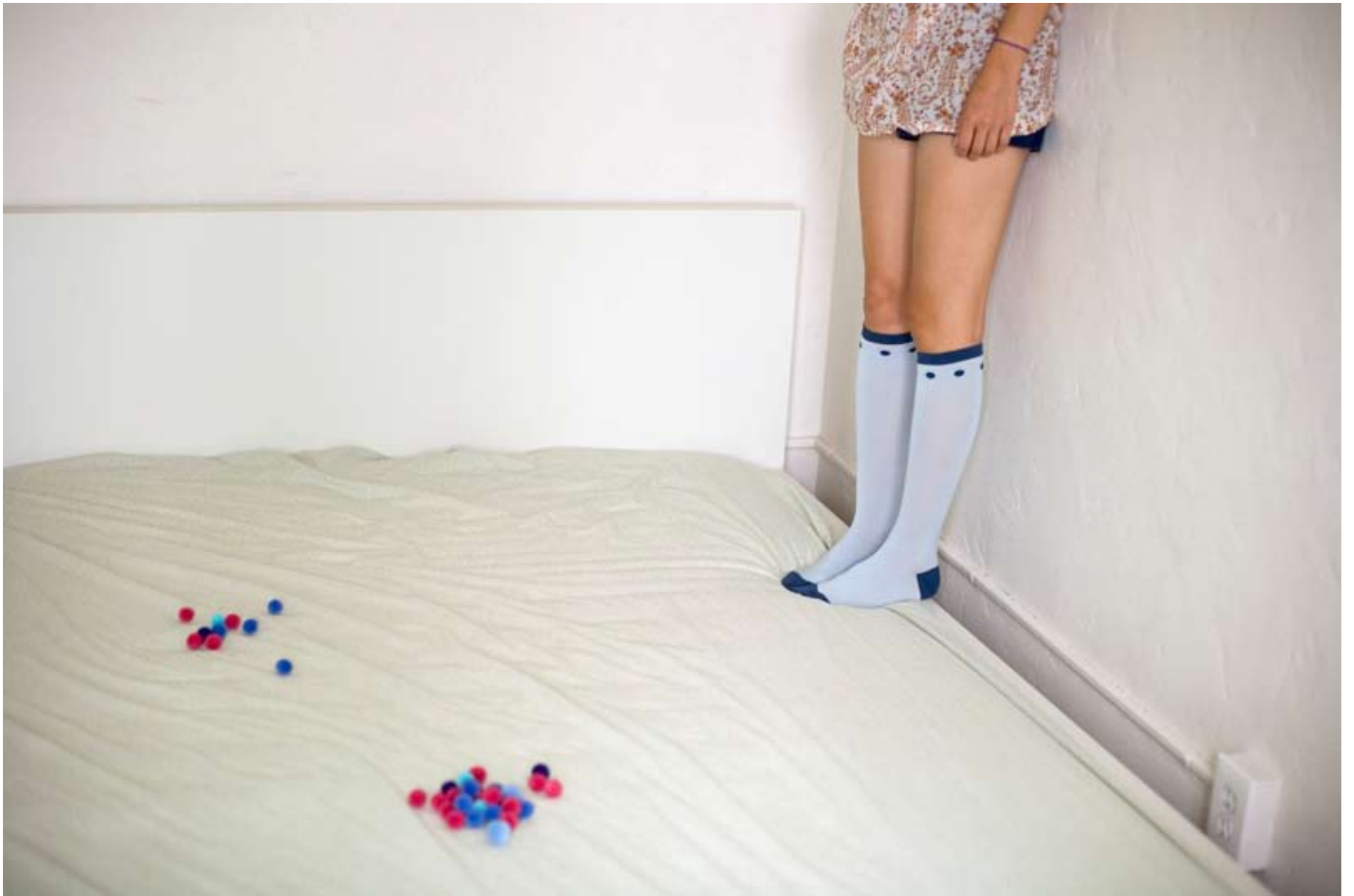
5. dot trimmed party socks with a zig-zag-mania pattern detail. mercerized cotton knee-hi.