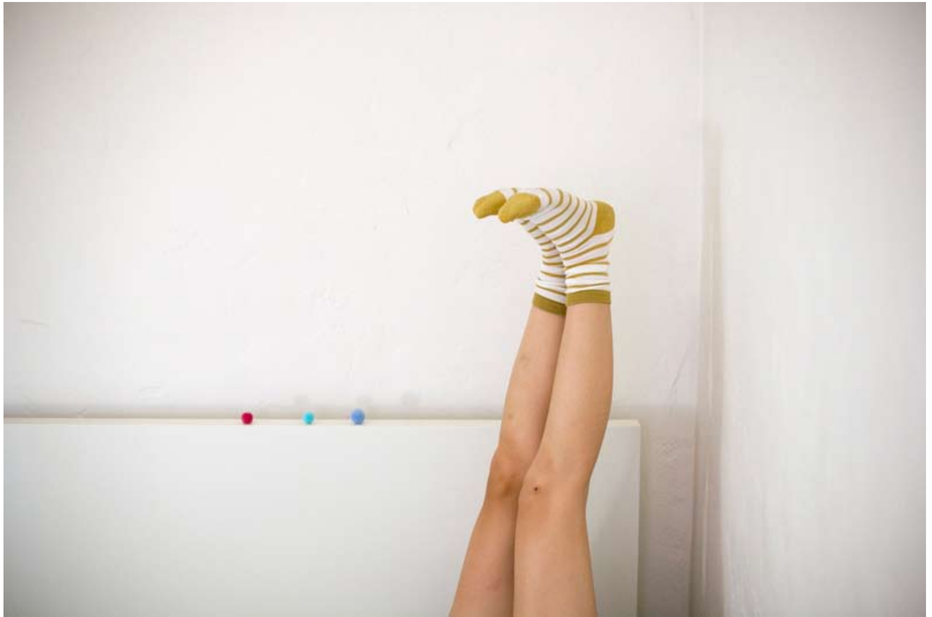
1. if my boyfriend stole my socks, these would be it. mercerized cotton crew.