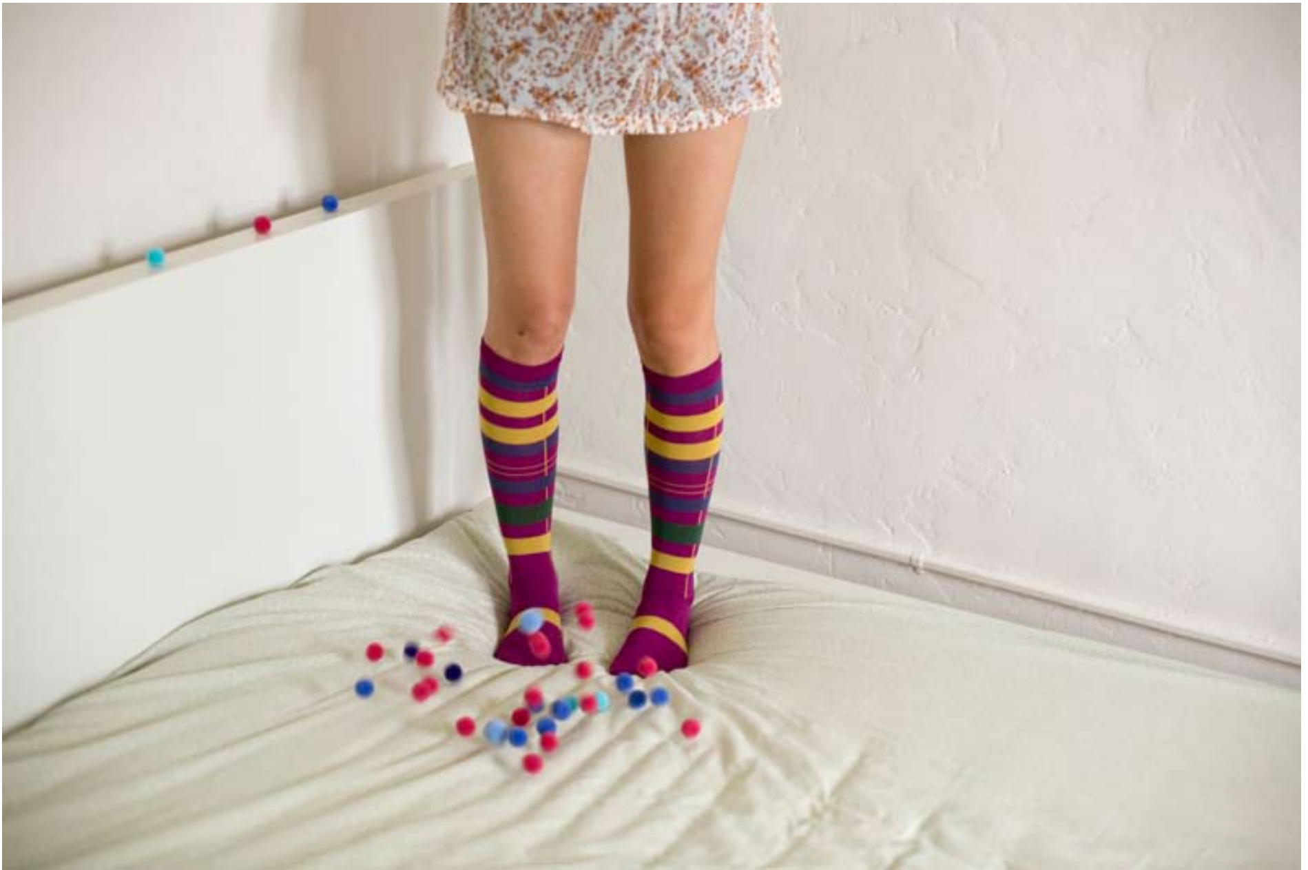
7. spring time preppy plaids.mercerized cotton knee-hi.